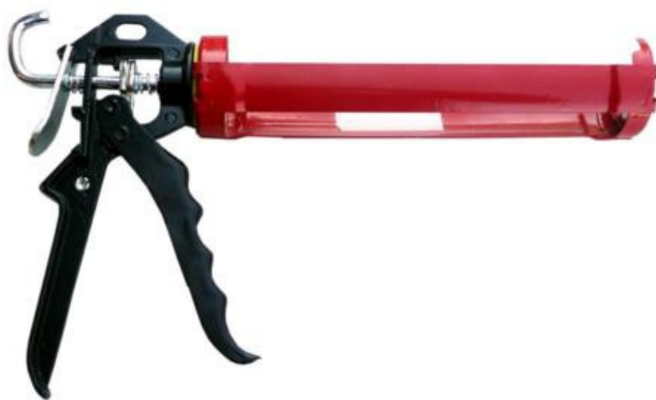
Manual extruder for LPS Sealant